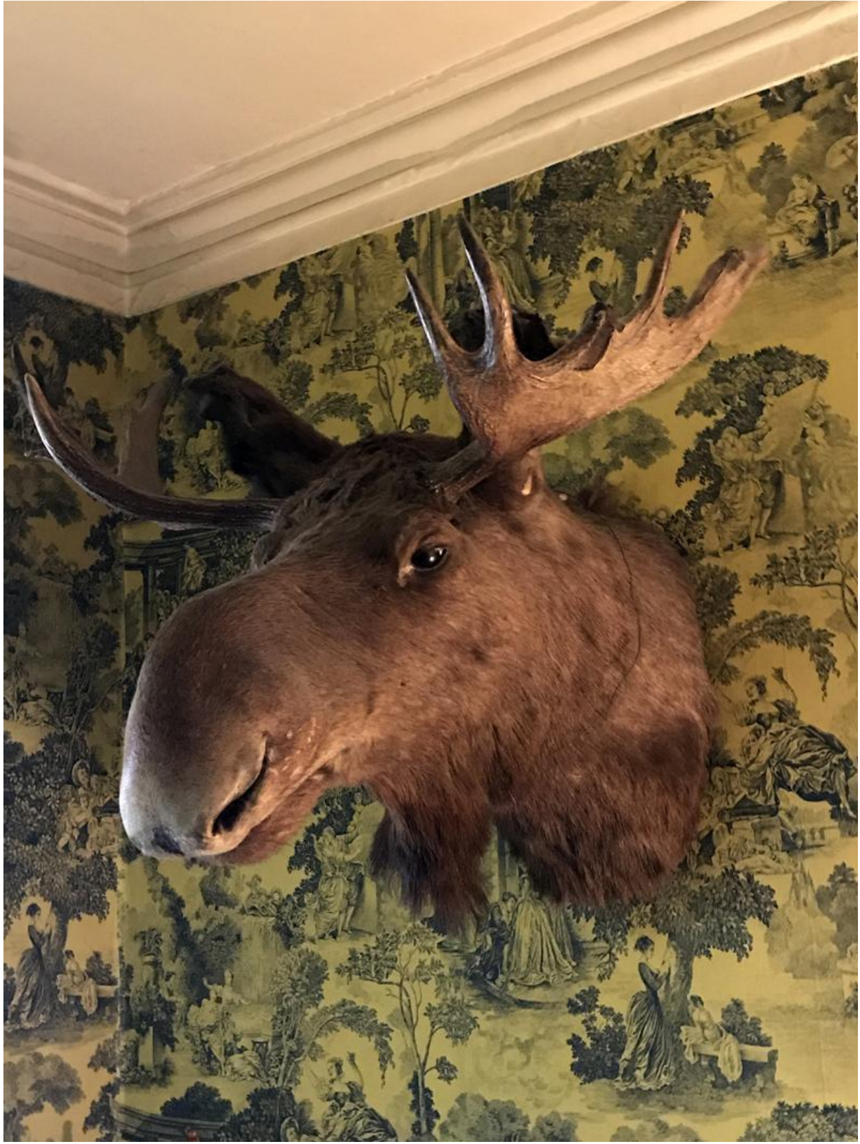
Moose casts a watchful Londonderry Arms Hotel, entrance, Carnlough, Antrim Coast