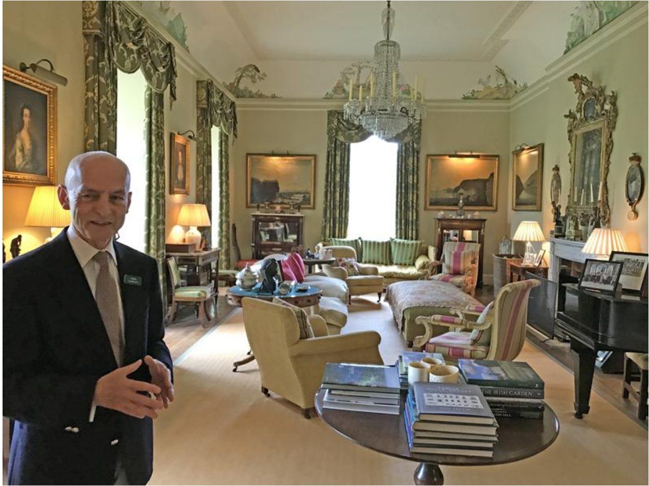
Butler welcomes guests in the drawing room at Glenarm Castle, Ballymena