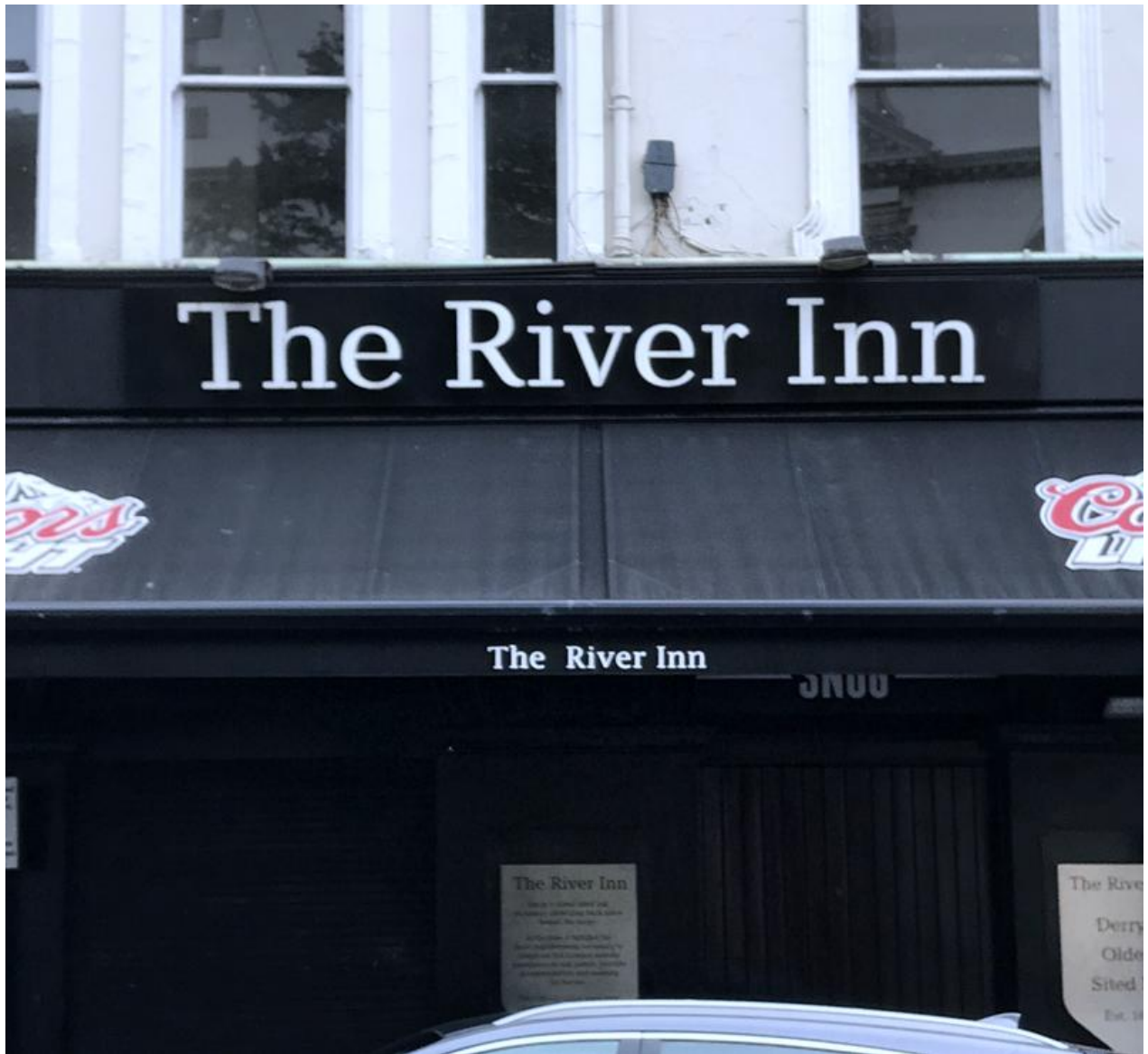
The oldest continuously operating pub on Shipquay Street in Derry, dating to 1684