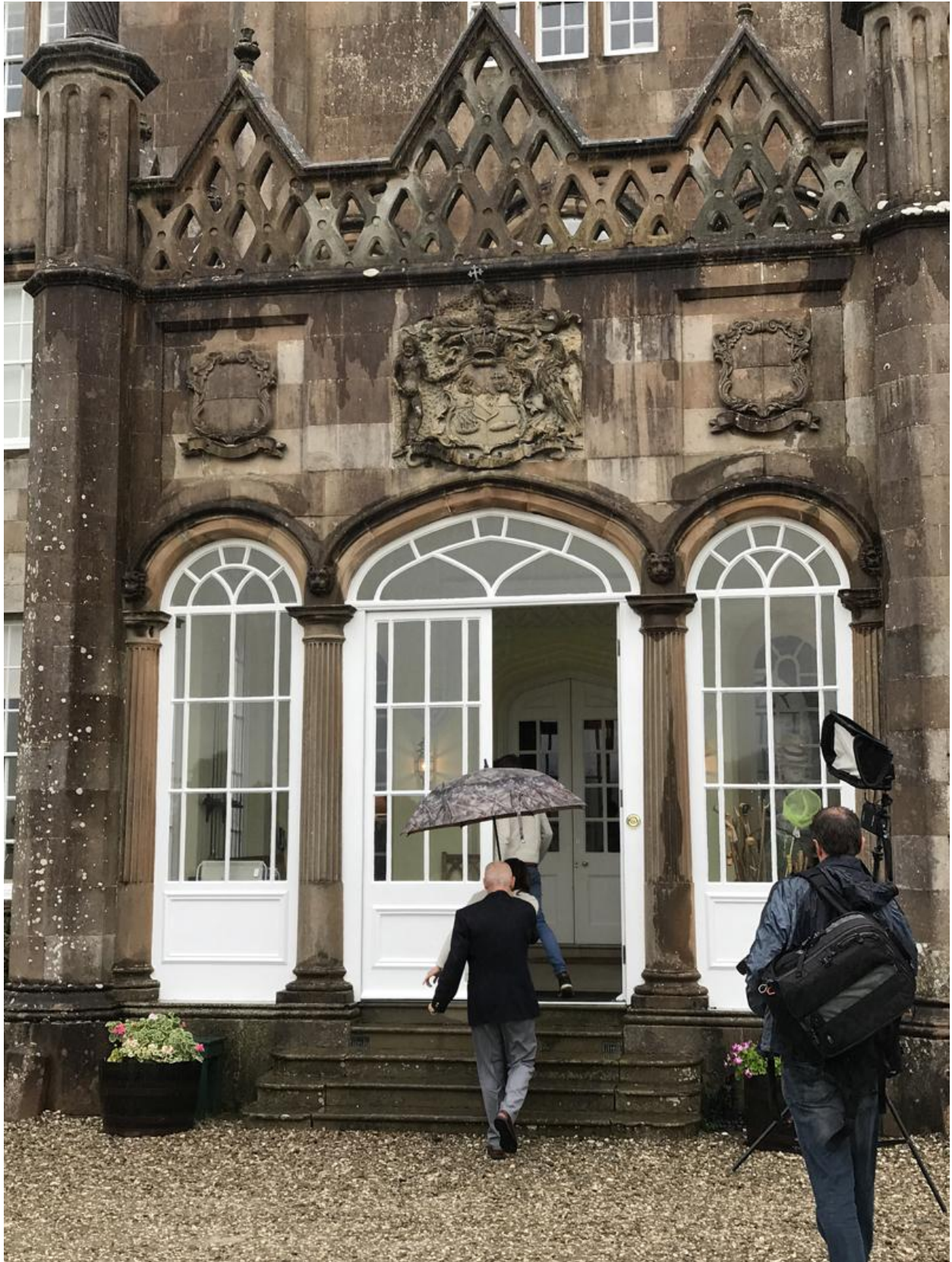
Getting in out of the rain at Glenarm Castle, ancestral home of the McDonnell family