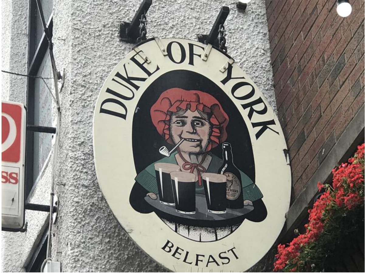
Historic Duke of York pub, Belfast