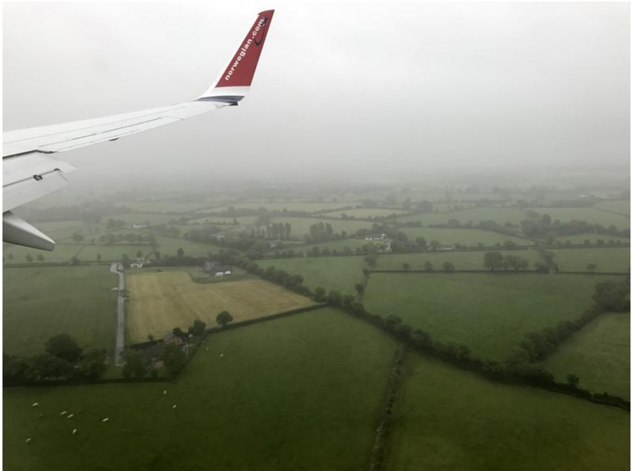
Norwegian Airlines descends into Belfast airport on inaugural flight from Providence