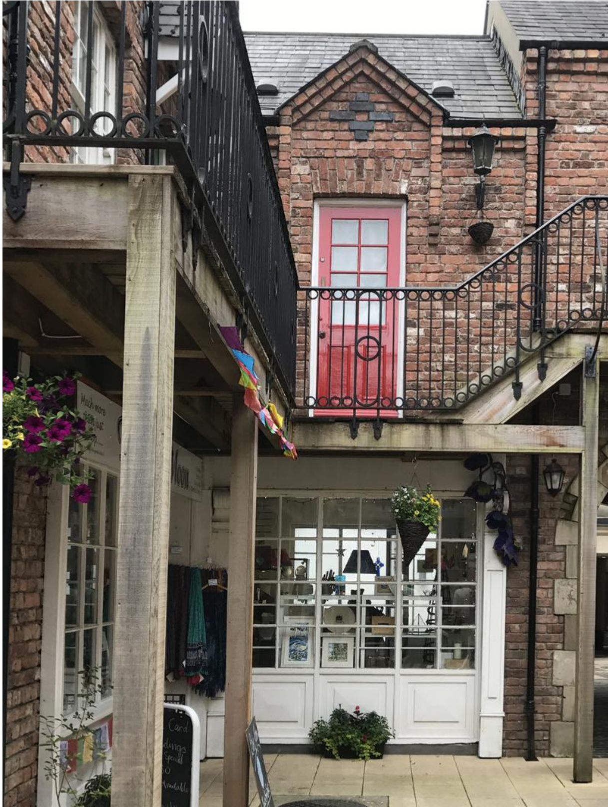
Reconstructed shops from the 1700s make up Craft Village in Derry