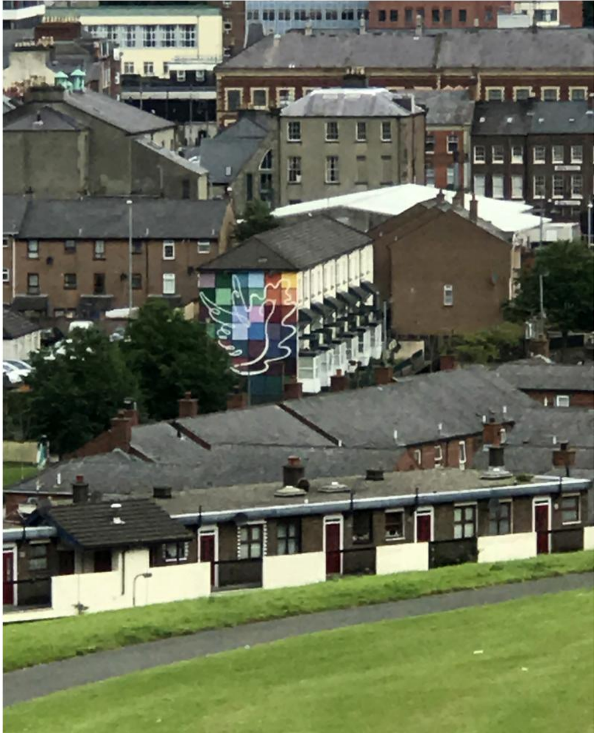
View of Derry -- and dove painting - from city wall