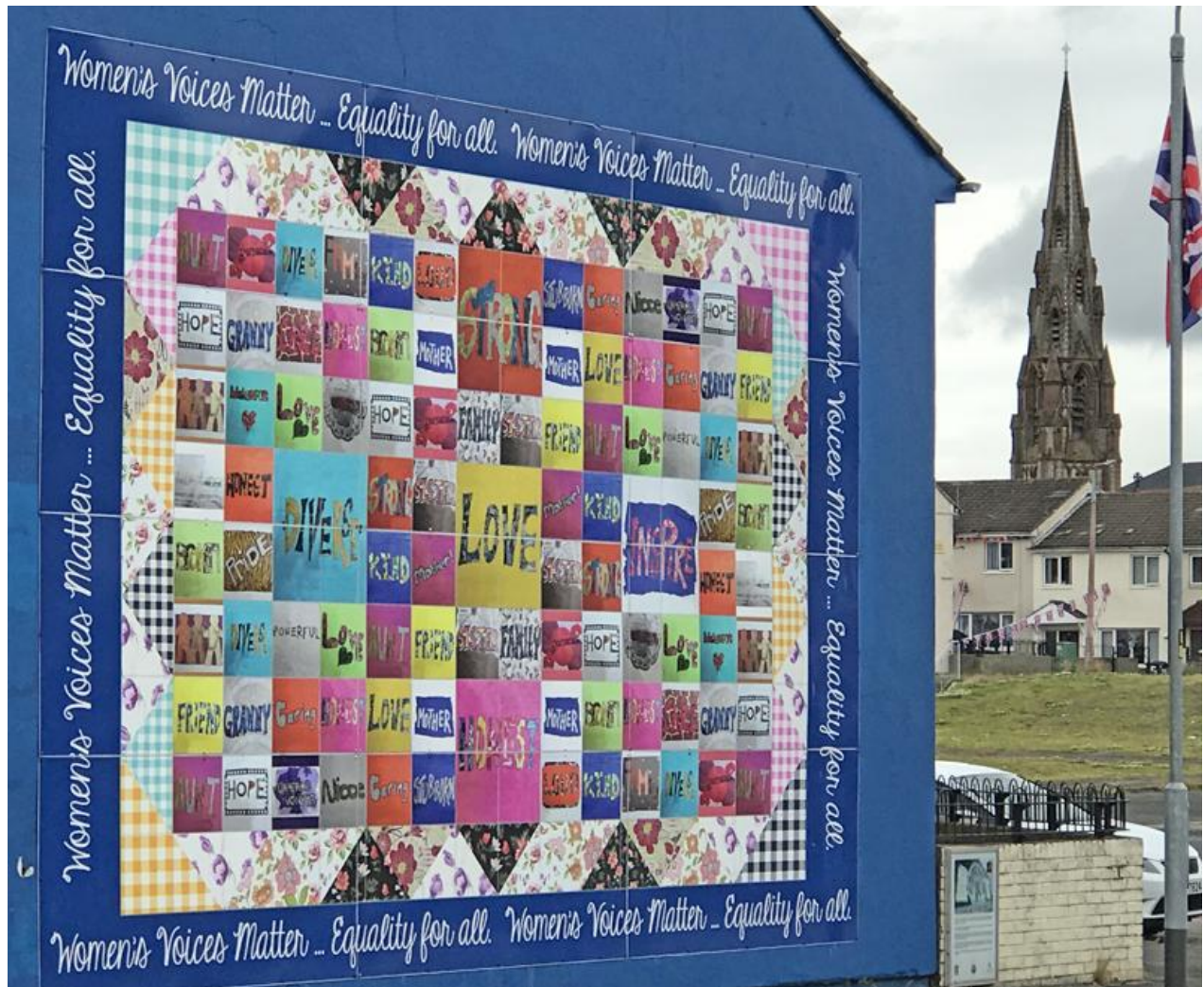
Women's Voice Matter mural Shankill Road area of West Belfast