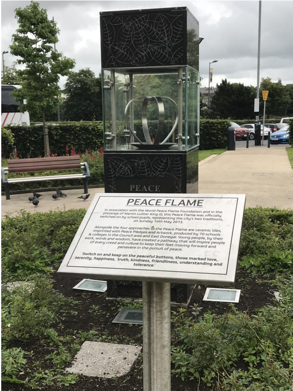
Peace Park in Derry overlooking the River Foyle