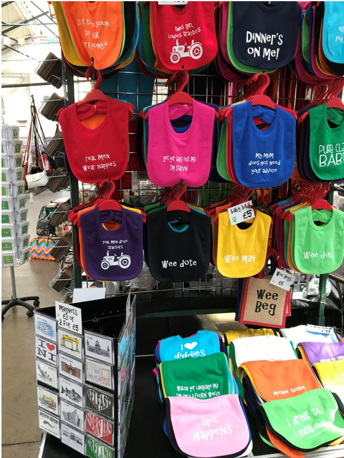
Bibs for tiny people at St. George's Market, Belfast