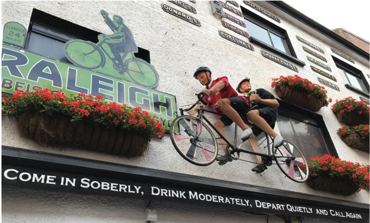
3D Raleigh Bicycle Sign, Cathedral Quarter, Belfast