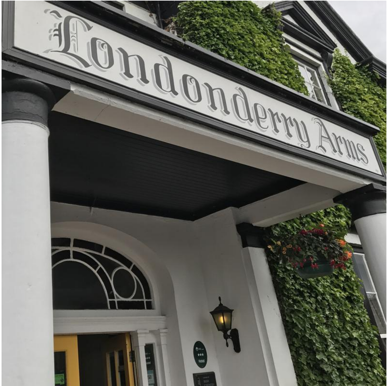
Londonderry Arms Hotel in Carnlough on the Antrim Coast