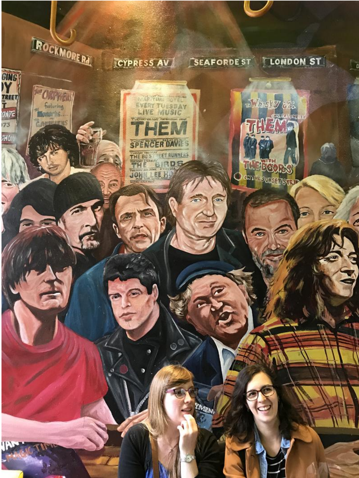
Identify the faces: Actor Liam Neeson from Northern Ireland in the middle, real people in the foreground, Commercial Court, Belfast