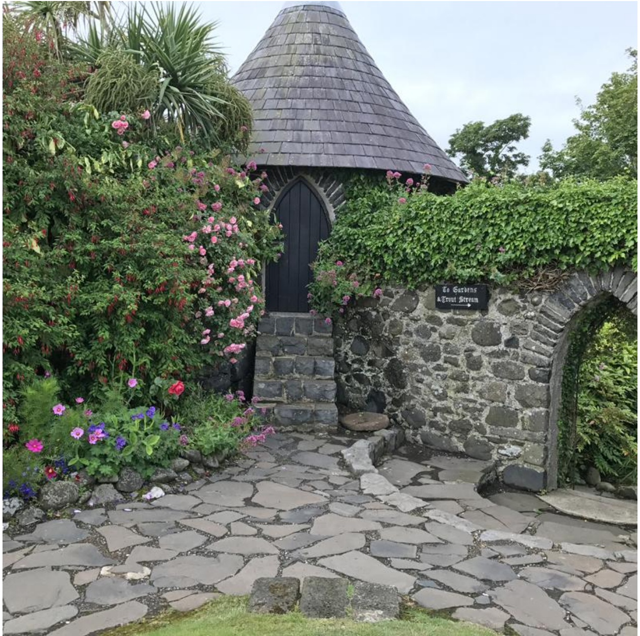
Walled garden at Ballycally Castle in the village of the same name on the Antrim Coast