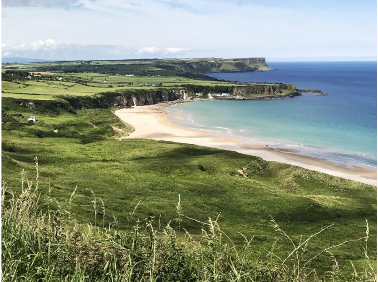
The coastline near Ballintoy, Glens of Antrim