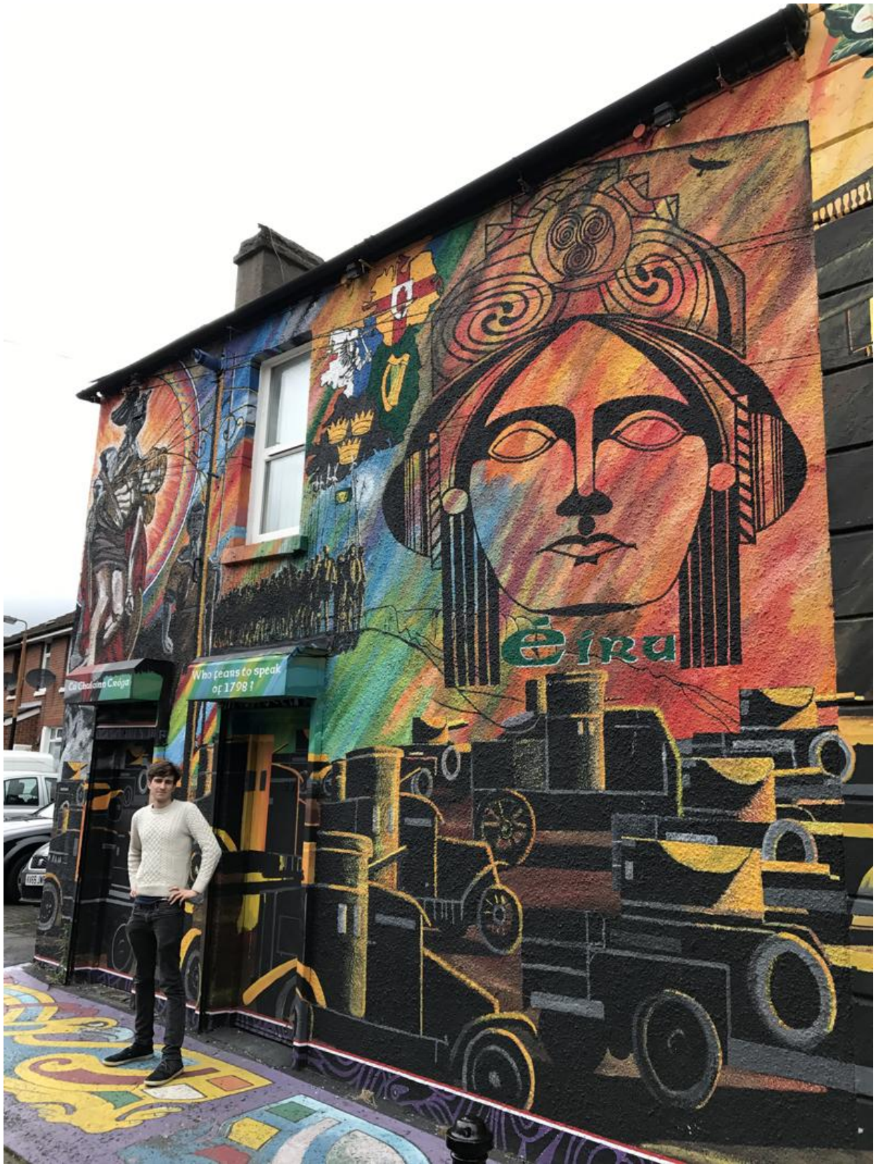
Mural memorializing the Easter Rising, McQuillan Street and Falls Road, Belfast