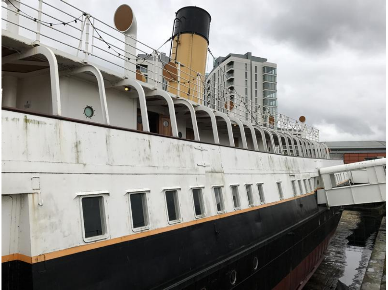
The Nomadic a restored tender to the Titanic at the site of the museum