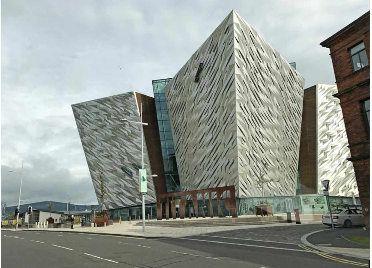
Titanic museum in Belfast features every aspect of building the “unsinkable” ship